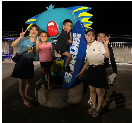
4 children of homestay family