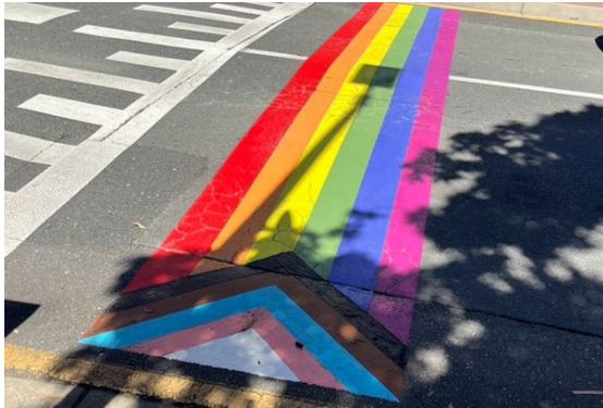
Respect for Diversification incl LGBTQ

rest assured that you can work with your teachers and fellow students. Also, about English proficiency. The local people listen to us seriously even if our English is poor, and I think that by staying for a long time, we will be able to greatly improve our English speaking and listening skills.