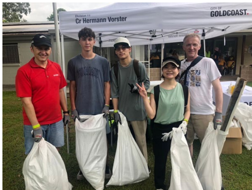
Cleaning up at Varisty Lake