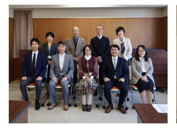
Speakers and Faculty Members